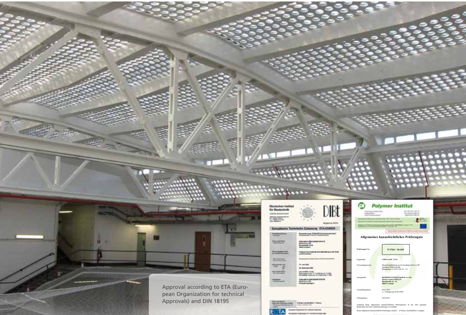
Approval according to ETA (European Organization for technical Approvals) and DIN 18195